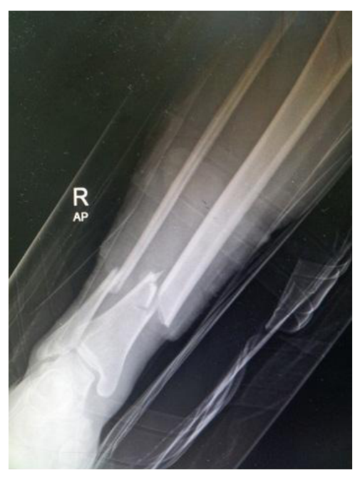
Figure 2: X-ray image of a fracture