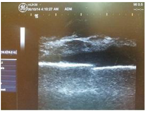
Figure 1: Ultrasoud image of fracture

A total of 48 patients were chosen on a voluntary basis during the data collection period. Two images were rejected by Radiologist for technical reasons (incomplete X-ray images)